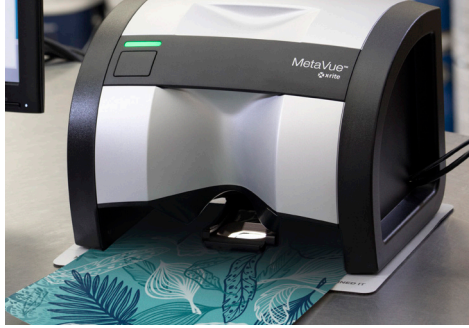
Identify multiple colors in a sample