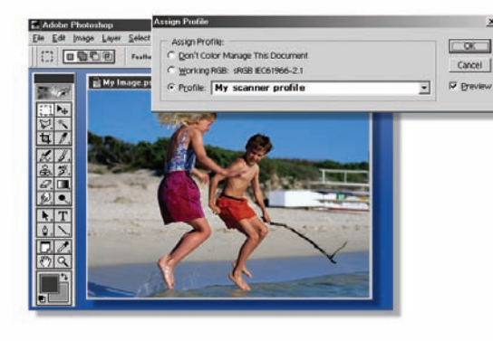
Make sure the image opens using an embedded profile, or apply the appropriate input profile: Image > Mode > Assign Profile.