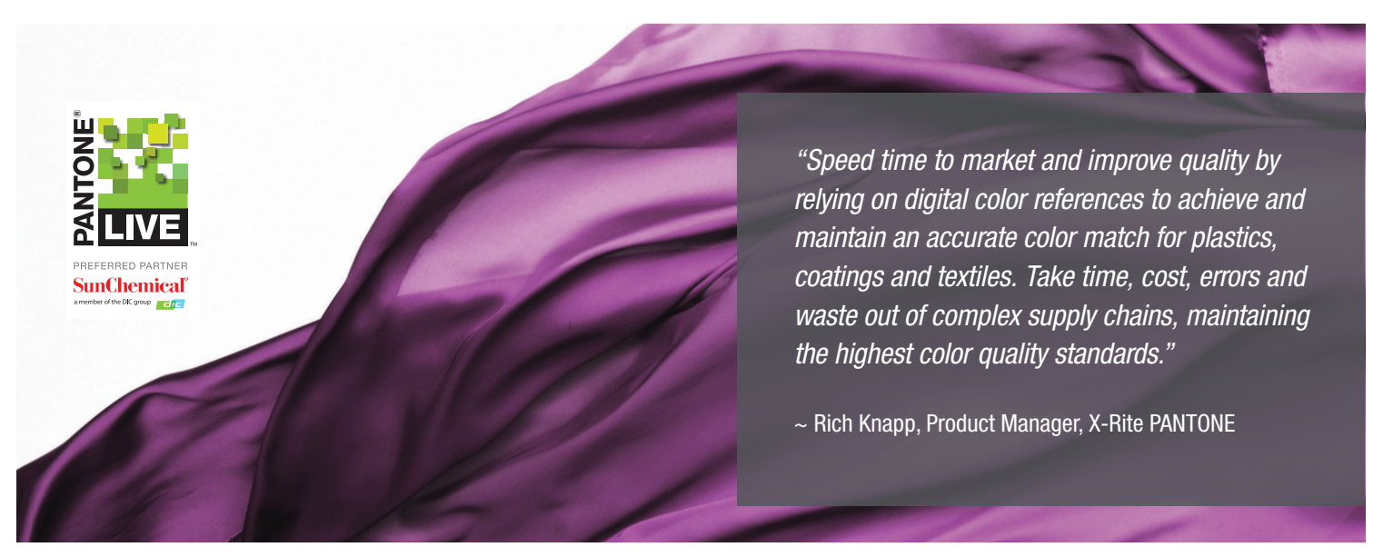
With PantoneLIVE Production - Plastic, Coatings and Textile digital libraries, brand specifiers and manufacturers are able to work from the same digital color standard from design to production.