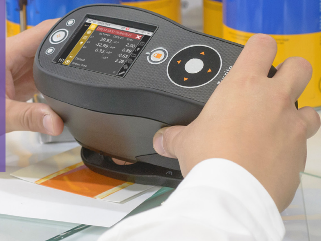
▲ PICTURED: Ci60 taking sample measurements in the lab