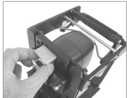
p/n: SP62-803 Liquid Cell Holder