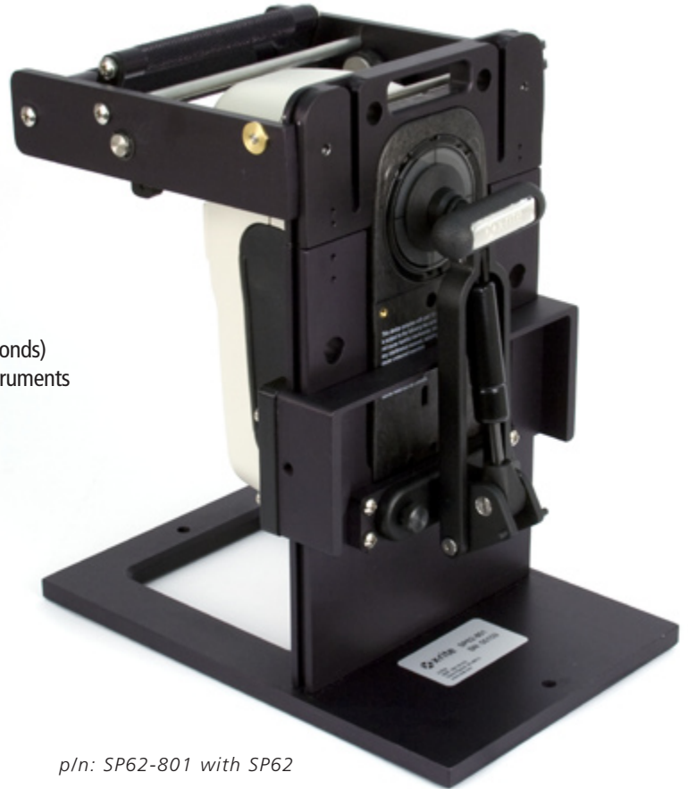
p/n: SP62-801 with SP62

W 7 1/4" (18.42 cm), L 10" (25.4 cm), H 10 3/4" (27.31 cm)