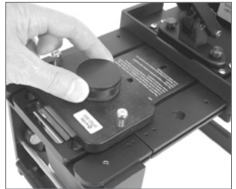
p/n: SP62-802 Powder Cell Holder