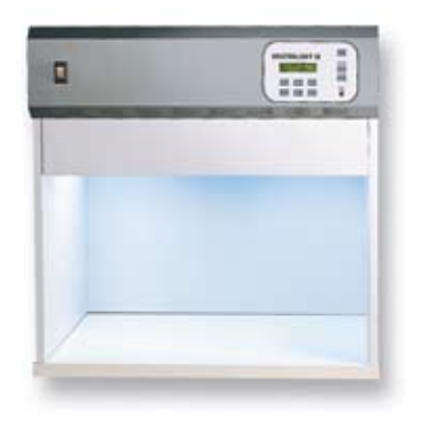
*A daylight-balanced light or viewing booth such as the Macbeth SpectraLight® or Judge® from X-Rite.

Under controlled lighting,* arrange four sets of precisely colored caps in order from one hue to another. The fewer errors, the better your color discrimination. The caps differ from one another subtly, so that each wrong placement reveals a different type of color vision deficiency.