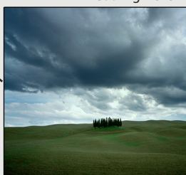
Cooling Level 2