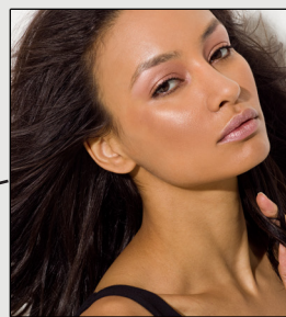
Warming Level 2