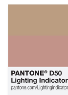
viewed under incorrect lighting conditions