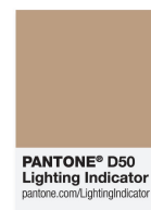
viewed under correct lighting conditions

Avoid errors by ensuring that customers view their jobs in the appropriate lighting.